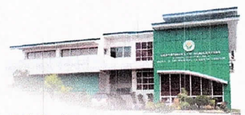
DA-DOS, Matatag at Maayos