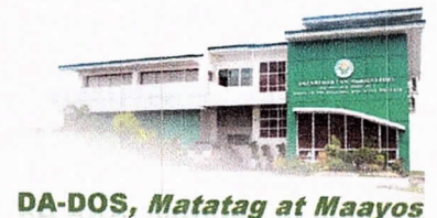
DA-DOS, Matatag at Maayos