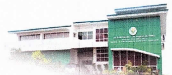
DA-DOS, Matatag at Maayos