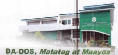
DA-DOS, Matatag at Maayos